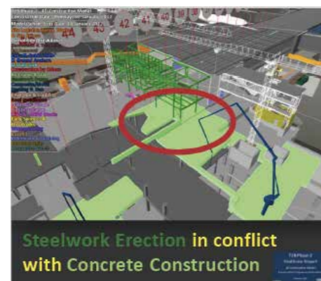
Steelwork Erection in conflict with Concrete Construction

enables designers and contractors to simulate operational procedures to check that they are going to work as intended and without risk before construction.